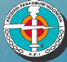
Indonesia Geothermal Association