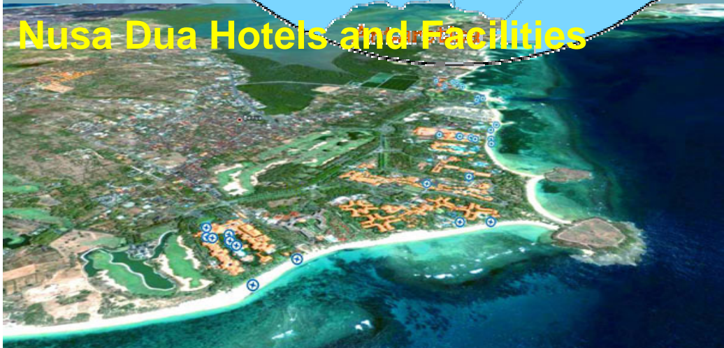
Bali International Conference Center